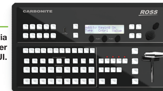
Carbonite Black Solo

> Control PivotCam via Carbonite Production Switcher or DashBoard GUI.